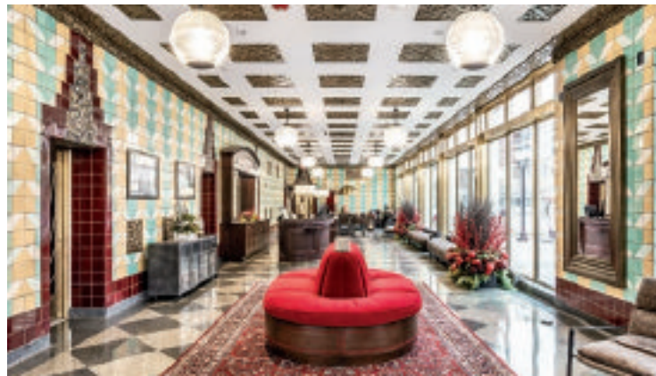
From top: the hotel's white terra-cotta exterior; the restored lobby; the rotunda's spiral staircase

Save room for scoops of Lick Ice Cream's Cedar & Whiskey for dessert.