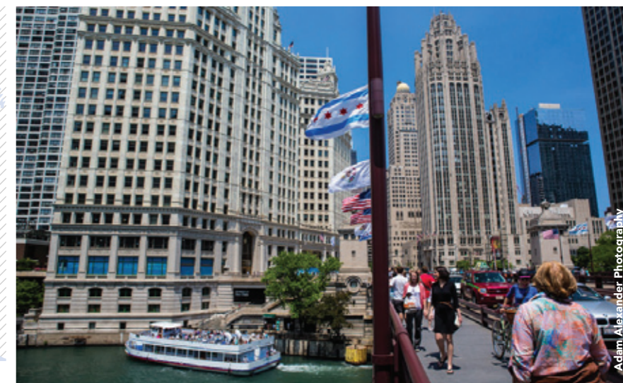
From top: Michigan Avenue Bridge; lamb dumplings and cucumber from Pub Royale

A couple of newer steakhouses are giving old favourites such as Gene & Georgetti a run for their money. In trendy West Loop, Swift & Sons offers a surprisingly adventurous menu. There