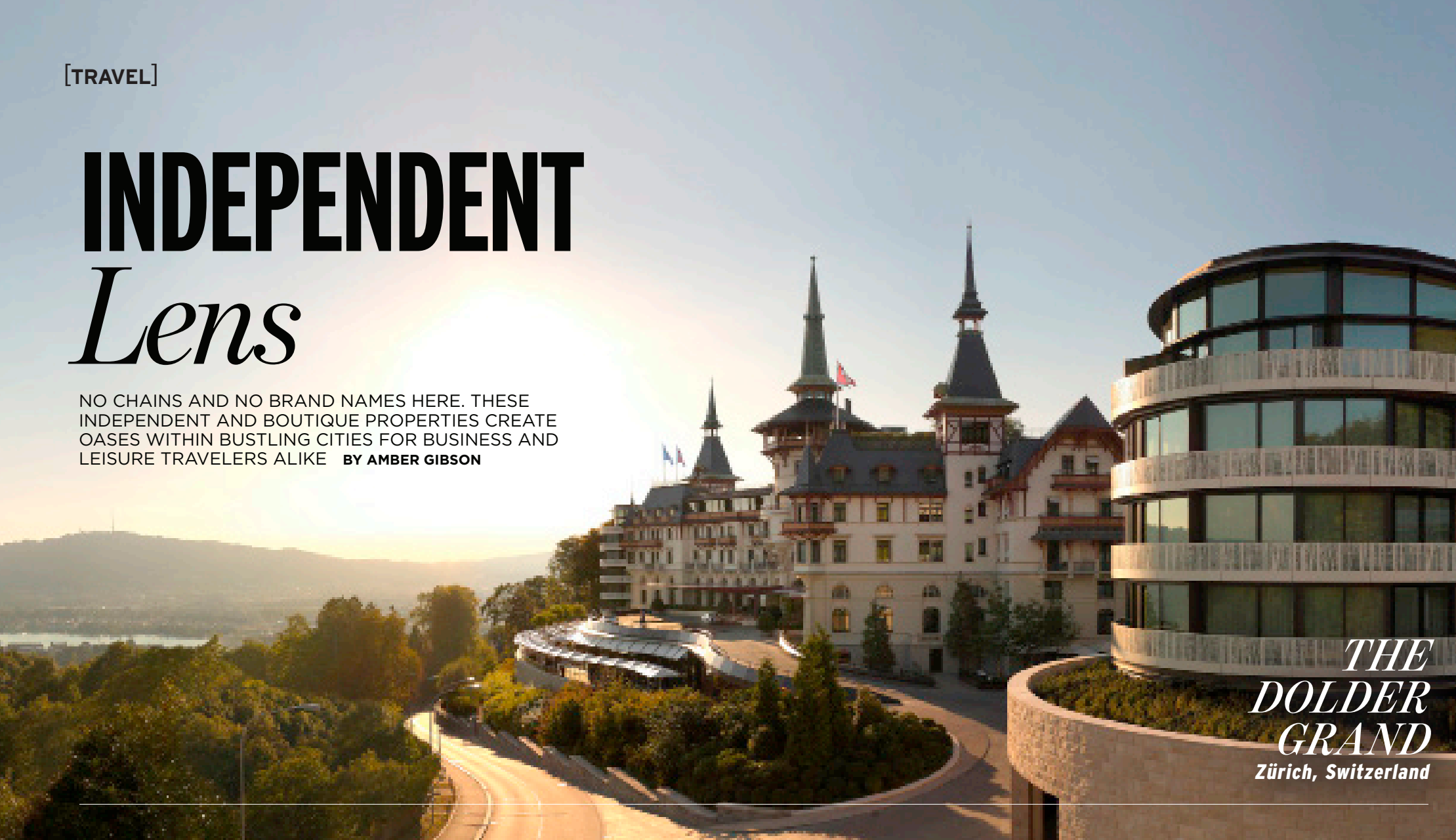
THE DOLDER GRAND Zürich, Switzerland